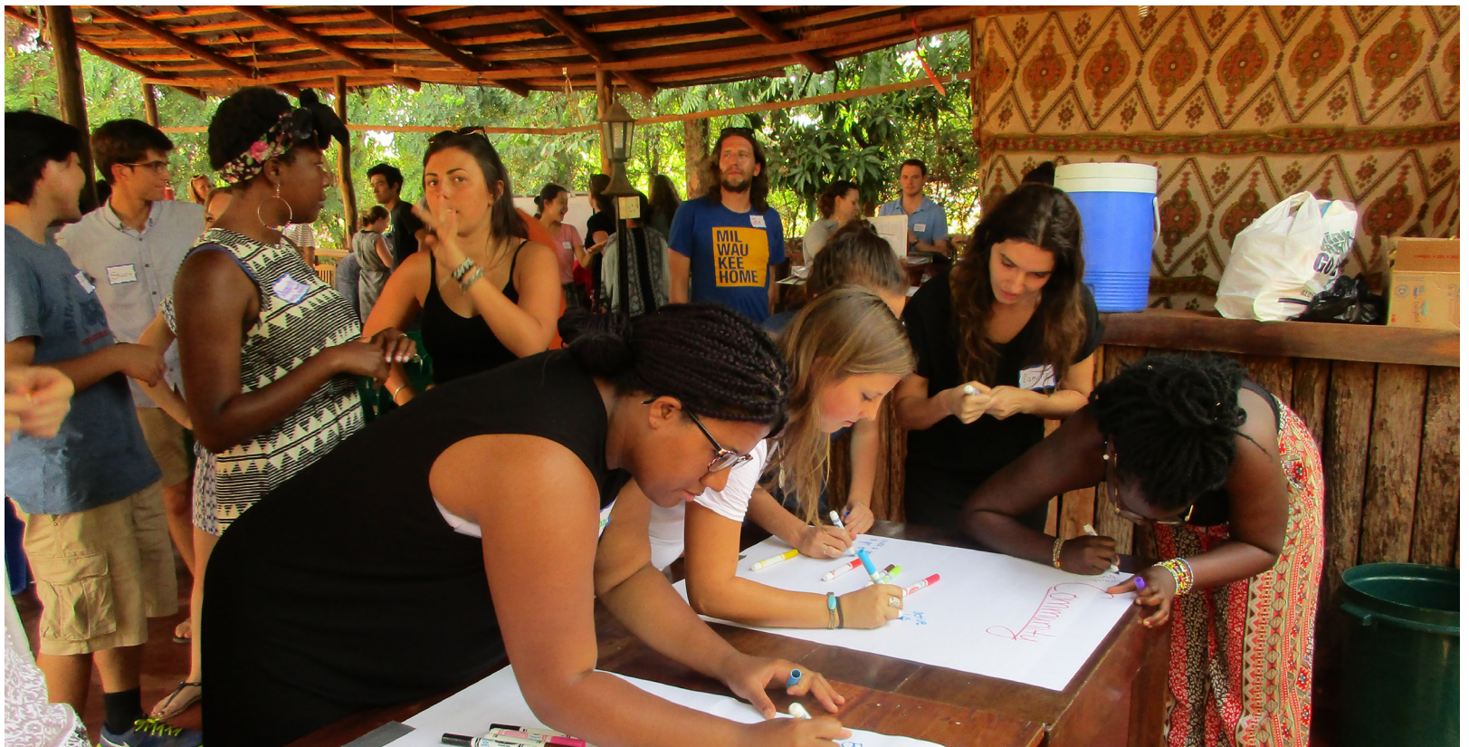
Fellows participating in a reflection activity during the 2017 Leadership Retreat.